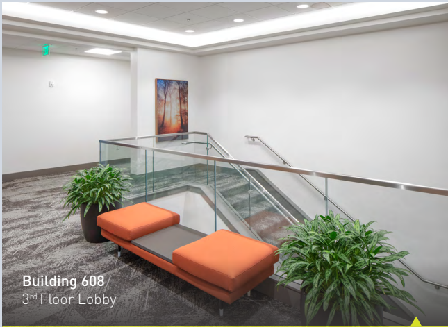
Building 608 3 rd Floor Lobby

Welcome to Columbia Tech Center. We're excited you're here.